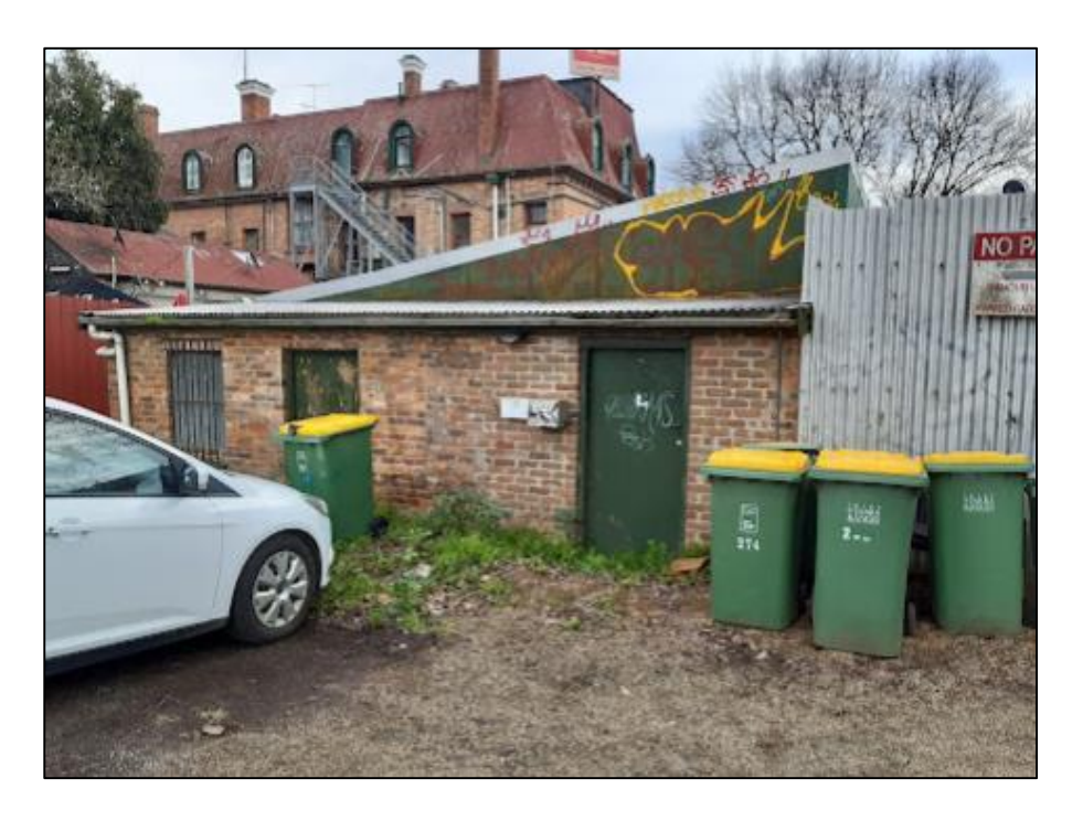
Figure 6 Common parking area facing North (closer)