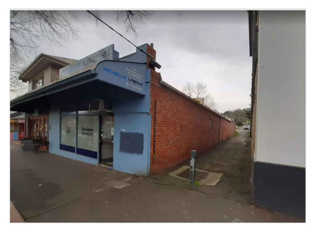
Figure 1 Site Building Frontage