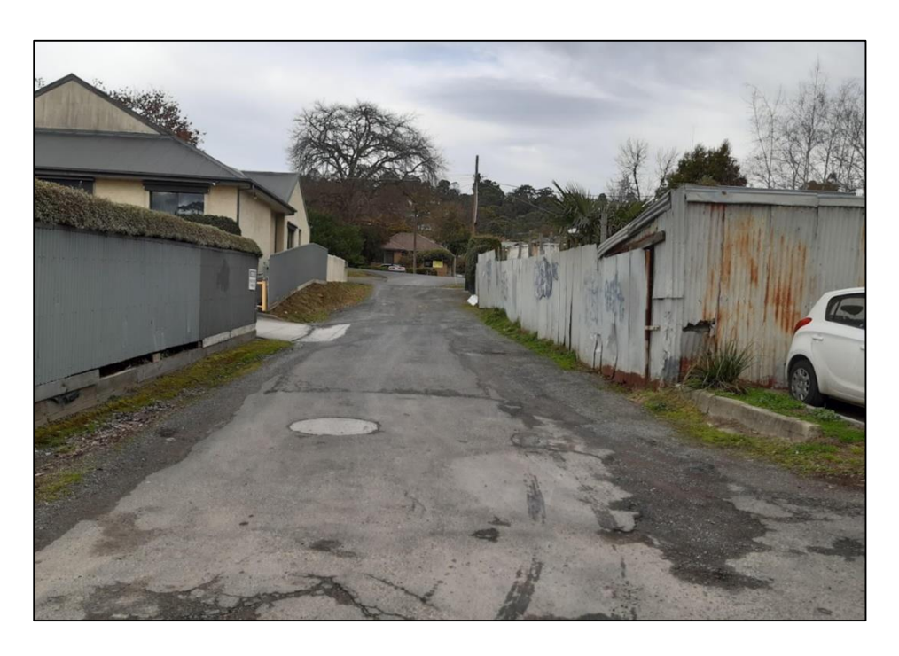
Figure 8 Council Road from Symon Street - lending to carpark- south facing