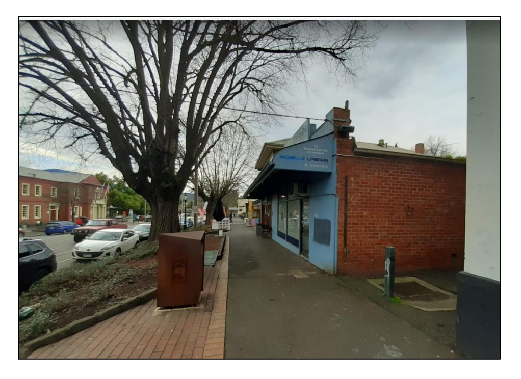
Figure 2 Frontage facing East