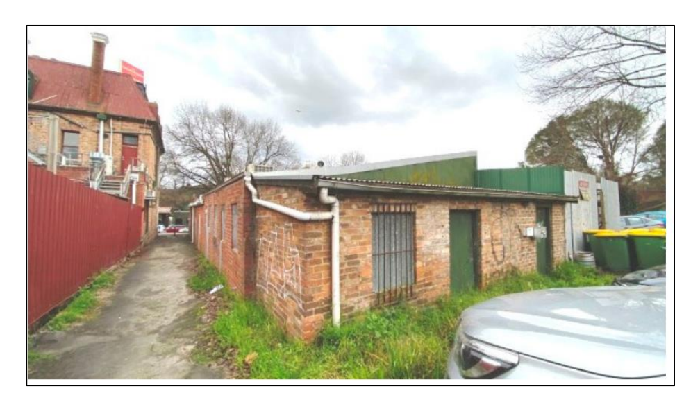
Figure 3 Site Rear Building facing North