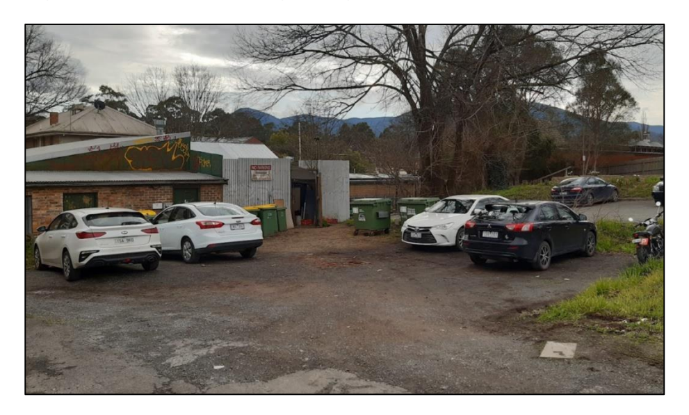
Figure 4 Common parking area facing North-East